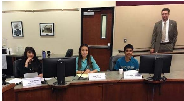
City of Elk Grove Summer @ City Hall Mock Council Meeting featuring youth participating as city staff (City Manager, City Attorney, and City Clerk).

Vision: Local governments and schools collaborate to prepare students for civic life and college/career readiness.