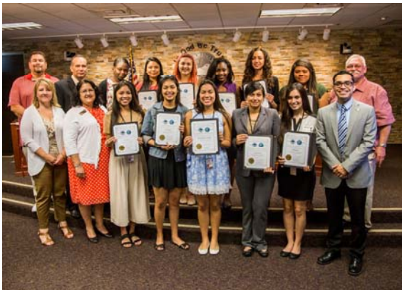
City of Moreno Valley 2016 Summer @ City Hall