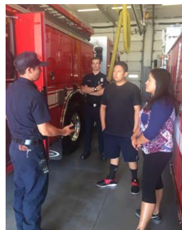
City of Oxnard Summer @ City Hall Youth get a tour of the local fire department