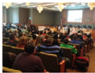
Youth Present to the Board as Family and Peers Listen

A variety of programs engaging youth in government have provided students opportunity to learn about local government, careers in local government and how to advocate for community change. The Institute's Governments Engaging Youth (GEY) project is working to support, expand and enhance municipal-school partnerships that increase youth-civic education opportunities, including exposure to public sector careers.