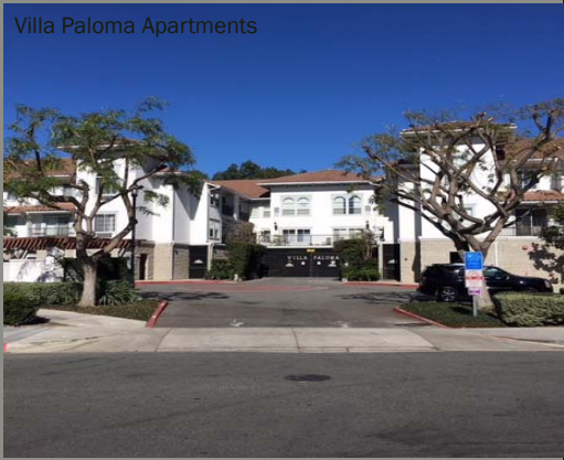
Villa Paloma Apartments

Villa Paloma Apts 84 Senior Units San Juan Capistrano, CA