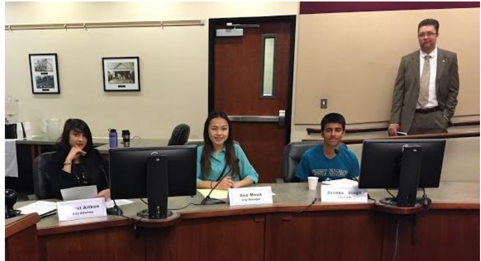
Elk Grove youth participating as City Attorney, City Manager and City Clerk

Communities and schools collaborate to prepare students for civic life and college/career readiness.