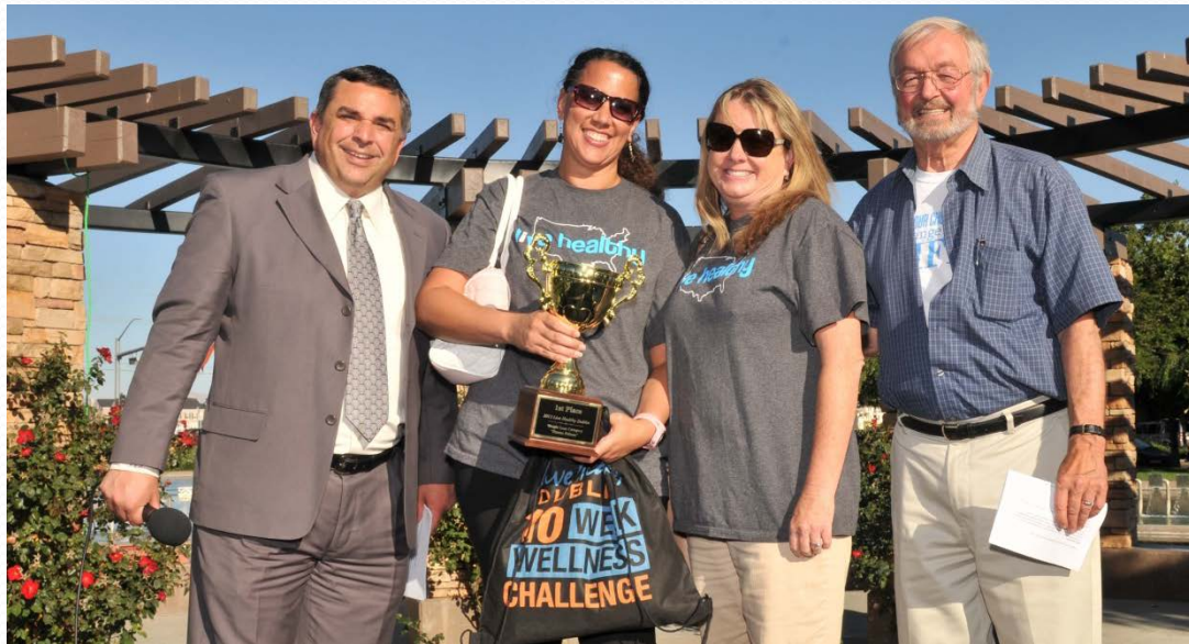
Pictured above: City of Dublin celebrates its 10-week wellness challenge