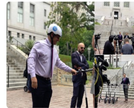
10:07 AM - 4 Sep 2018 from Los Angeles City Hall

The future is here. Los Angeles must create citywide multimodal infrastructure to reduce traffic, link people to public transit, & reduce green house gas emissions. #escooters 🛴 #ebikes 🚲