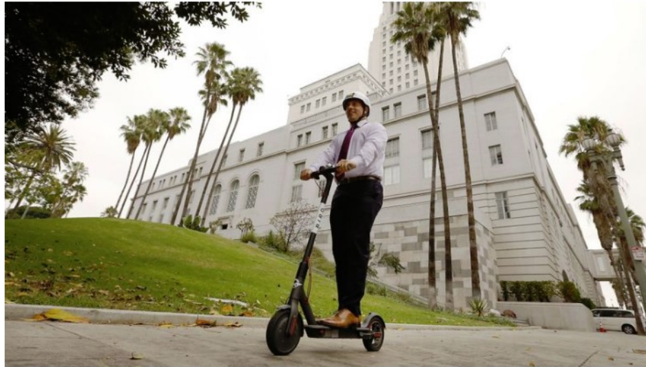
Los Angeles City Councilman Joe Buscaino rides a Bird rental scooter around City Hall on Sept. 4.